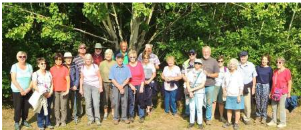
The Bedford U3A Short Walkers entered the Marston Vale Community Forest on their Brewer's Fayre walk from Kempston.

There were 23 walkers on our 3.35 mile walk from the Brewer's Fayre in Kempston which takes in part of the Marston Vale Community Forest. In warm breezy conditions, we started from the pub's spacious car park before passing beneath Bedford's Western Bypass on a public footpath. Passing the industrial area, we followed the path to the south where we circumnavigate a large lake adjacent to the busy A412 road. From there we enter a forest pathway towards the village of Wootton. Back in the country park, an easy uphill path leads towards Kempston. On reaching the road, we use a different bypass tunnel after which we pass a Lidl supermarket on the left. Then crossing the road at pedestrian lights, we join a wide pathway which, after approximately three quarters of a mile, leads directly back to the pub where we stop for refreshments, the circular walk taking exactly 75 minutes.