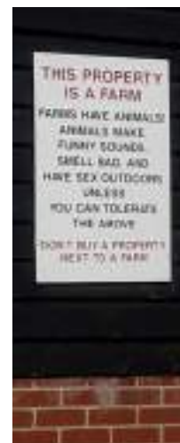
Town v Country