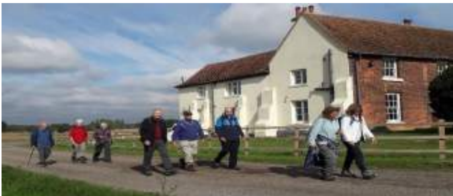
Passing an isolated farm house