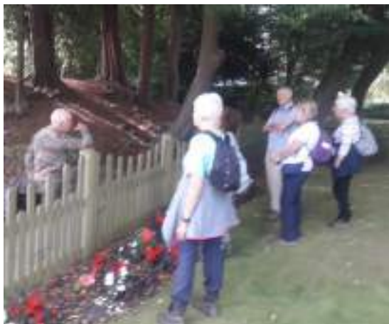
Learning the History of the Mound

Along Harding's Lane, whilst admiring the cyclamen flowering on 'The Mound' at a house of the same name, we were given an instructive talk regarding the history and myths of the mound itself!