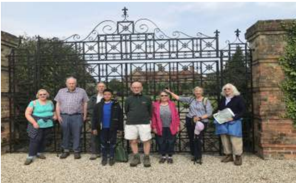
In front of Bride Hall's puzzling gate

the route back to the pub and found the five members who had opted for a shorter walk already ensconced on tables in the garden, enjoying their drinks.