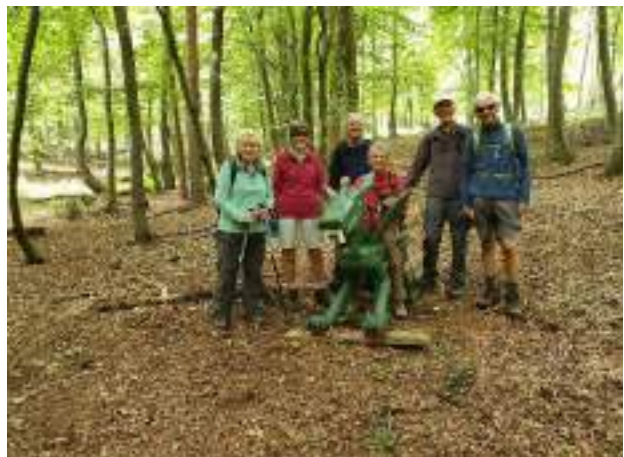
Photos: Coombe Hill Monument, Ellesborough Church with flag at half mast , Chequers, Green dragon

After leaving the Chequers Estate the route swings in a south easterly direction to Little Hampden first mentioned in the Domesday Book of 1086. The route then turns east where, a short way down the path, a green dragon is waiting for you on the left-hand side. Follow the path to Hampdenleaf Wood and turn left onto the footpath north to Dunsmore Old Farm. Go left again at this point, until the path rejoins The Ridgeway gradually ascending to Coombe Hill. Leave The Ridgeway near the top of the hill and take the footpath on the right back to the car park.