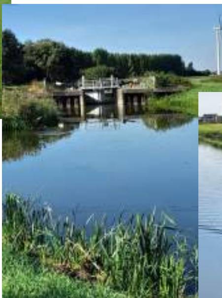
Lock Gates Old Nene