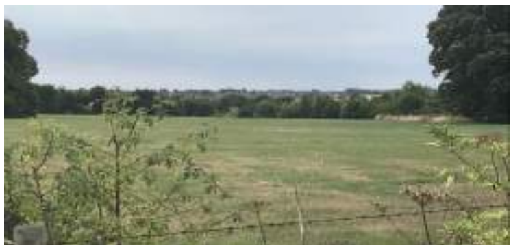
View of Herts Countryside

diagonally left to find FP 36, cross FP 37 (Hertfordshire Way) and continue straight on FP13; emerge onto road and turn right along Bride Hall Lane until reach gates to Bride Hall; enter through the wicket gate to find FP42 and continue to Lamer House complex; turn left onto FP41, skirting the house on righthand side, and find FP85 on the right; follow FP85 until it meets FP36; turn left onto FP36 and retrace steps back to the pub.