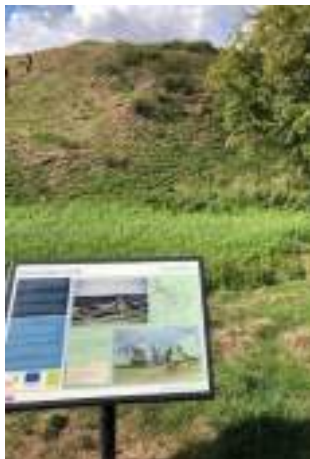
The site of Fotheringhay Castle