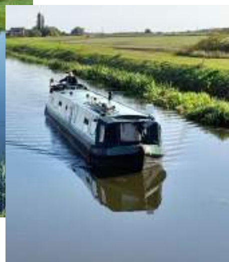
Narrow Boat on Old Nene