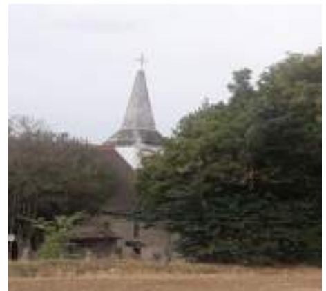
Little Burstead Church

Leaving the golf course and into Laindon Common, past St Basil's well. I hope he's not thirsty as it's dry. Then through a farmyard with a collection of antique tractors, along a path which had had a recent wildfire, and to our starting point.