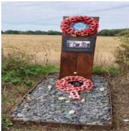
Photo of new memorial to crashed RAF plane near Hunsdon airfield. We had walked past this point many times over the years and interested to see this new memorial.

20th September starting from Marsh Lane carpark in Stanstead Abbots, Herts. 6 miles, 11 walkers walked towards Roydon on towards Hunsdon, on towards Little Briggens and then back to Stanstead Abbots. On way saw a new plaque commemorating plane crash and death of pilots in WW2.