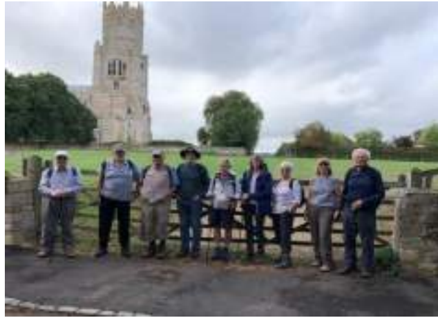
Near the start of the walk outside the Fotheringhay Church