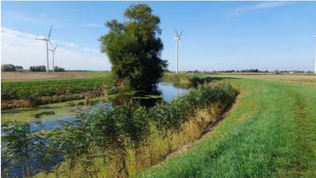
Wind Turbines Near Ramsey