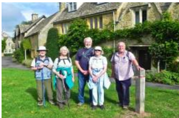
Five Bedford U3A members enjoyed a long weekend in the Cotswolds and are pictured here taking a break in Lower Slaughter.

In addition to our weekly walks, I also arranged for four fellow members to join me on a three-night Cotswolds break at HF Holidays' four-star Harrington House Hotel in Bourton-on-the-Water. The trip has been published in 18 local JPiMedia newspapers while it is also available to read on my own website at https://always-on-the-go.co.uk/453197866