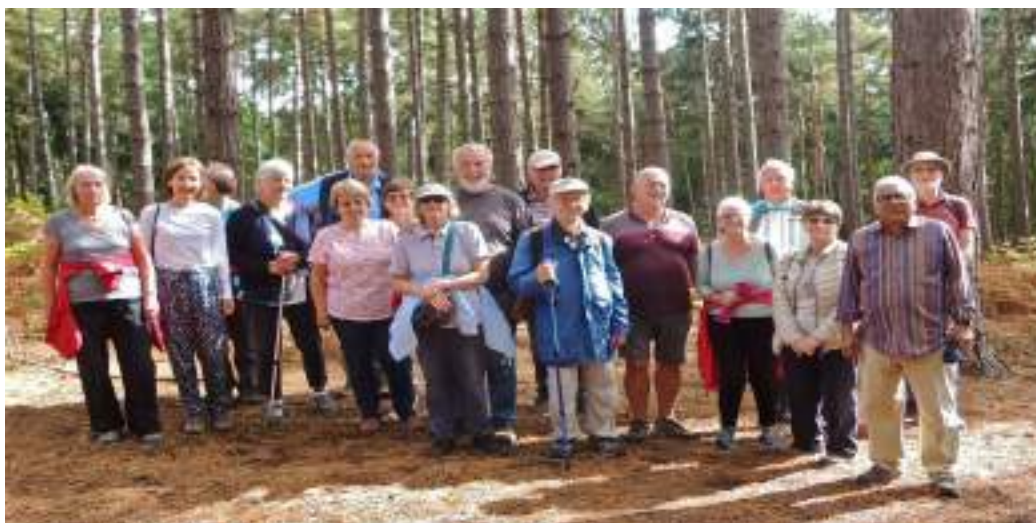
It was back into the woods for our Chicksands / Rowney Warren walk.

With just 18 walkers meeting in Sand Lane car park, today's 3.9 miles walk was spent entirely in pristine woodland and took exactly 85 minutes. Leaving the car park, we head south on a short 1.1 mile circular loop around Chicksands Woods which lies adjacent to the Former US Air Force military base. Crossing Sand Lane, we enter Rowney Warren for a 2.8 mile loop on undulating ground, passing by the large fenced-off private mountain bike area which was used by many athletes in preparation for the 2012 London Olympics. Afterwards we called for refreshments at The Greyhound pub in Haynes village.