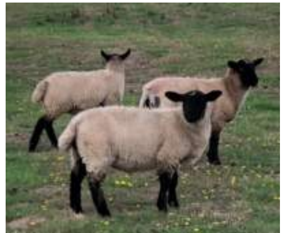
Walking the same footpath - possibly members of the local Ewe 3A!