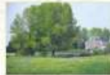
Black Poplar tree

Perhaps because of its grooved bark, or the story that grey stinked black oak winter-very turned into Black Poplars in Roman mythology, the tree was once considered sacred. Because of their rapid growth rate, the trees may have been regarded as a fertility symbol and were once dressed as part of wedding ceremonies. An annual Black Poplar Day (showing an early link) occurs in Aylesbury Open Day in Stoughton.