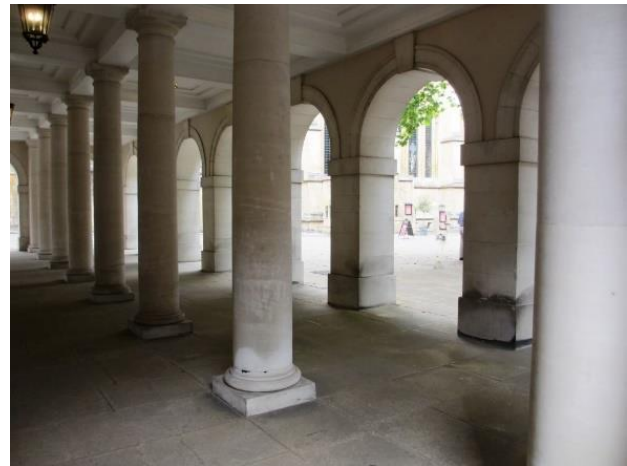
July visit to the Inns of Court.